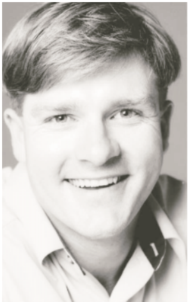
Parks Victoria Ranger

Climb Mt Loch and return to the vehicle track; continue for 0.5 km to rejoin pole line and follow it back to the Loch Carpark. For an overnight walk, the best campsite is on the Cobungra River near Dibbins Hut.